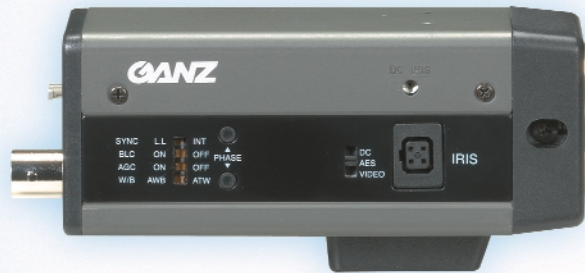
Side panel view