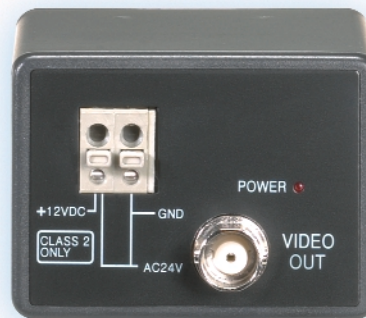
Rear panel view