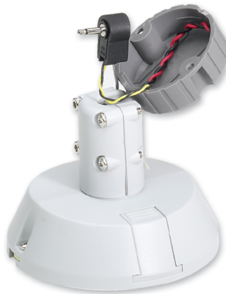
Optional Mounting Bracket with service monitor output